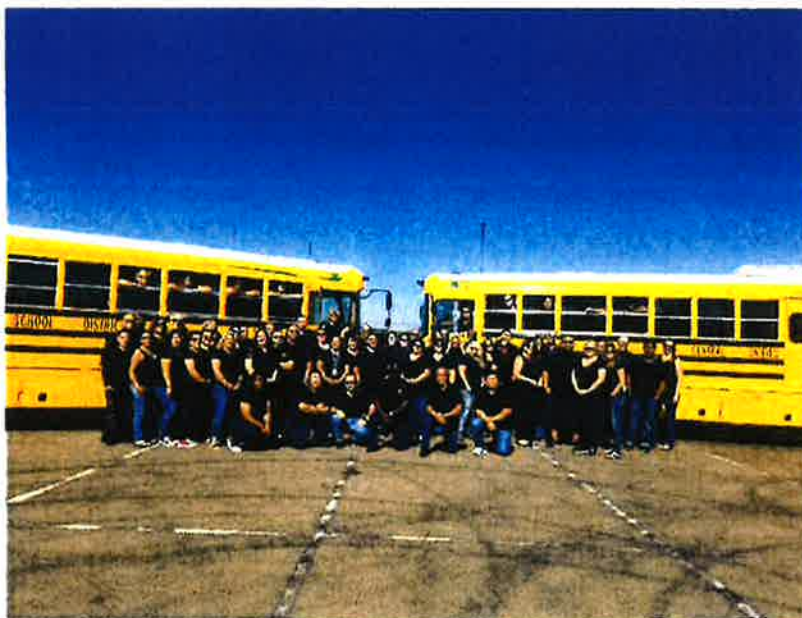
Central Unified School District Transportation Team