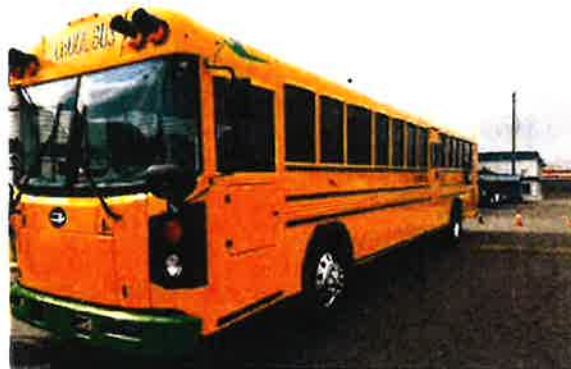
Blue Bird All-Electric School Bus